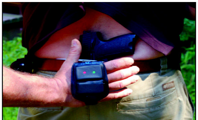
Can easily be looped through a belt